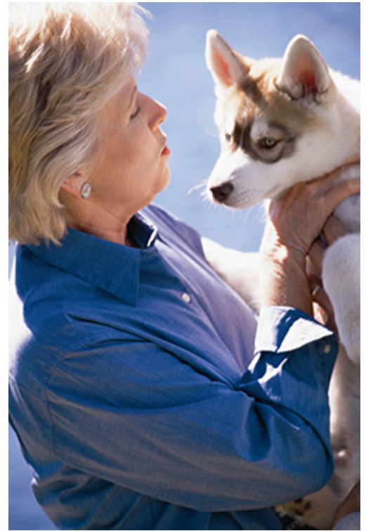
Table or people foods are not usually recommended for pets. Because they are usually very tasty, dogs will often begin to refuse their well-balanced dog food in favor of table food. If you choose to give your puppy table food, be sure that at least ninety percent of its diet is from a quality commercial puppy food. If not, follow a properly formulated recipe that has been developed by a formally trained veterinary nutritionist.

Each of the types of food has advantages and disadvantages. Dry food is definitely the most inexpensive. It can be left in the dog's bowl without spoilage for longer periods of time than canned or moist foods. Semi-moist foods may be acceptable, depending on their quality. The texture may be more appealing to some dogs, and they often have a stronger odor and flavor. However, semi-moist foods are often high in sugar and calories and should be carefully chosen based on their nutritional qualities rather than taste, packaging or consistency. Canned foods are a good choice to feed your dog, but are considerably more expensive than either of the other forms of food. Canned foods contain a high percentage of water, and their texture, odor, and taste are very appealing. However, canned food will dry out or spoil if left out for prolonged periods of time. Canned food is generally more suitable for meal feeding rather than free choice feeding.